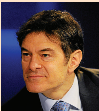
Dr. Mehmet Oz

Since the failed attempt to repeal the Affordable Care Act, Republicans have floundered without a vision for healthcare reform. It forces us to wonder, is Dr. Oz’s attempt to co opt “universal healthcare” while preserving profits in the industry, the future of the GOP? If so, corporate Democrats have certainly opened the door for them. HCN