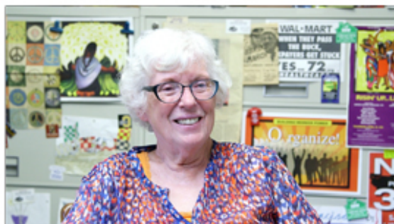
LANDSCAPE / HORIZONTAL